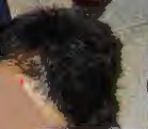
2yrs b4 treatment (thinned out more than this)