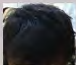
Early 2012 w/ 5 months back on - looking good...